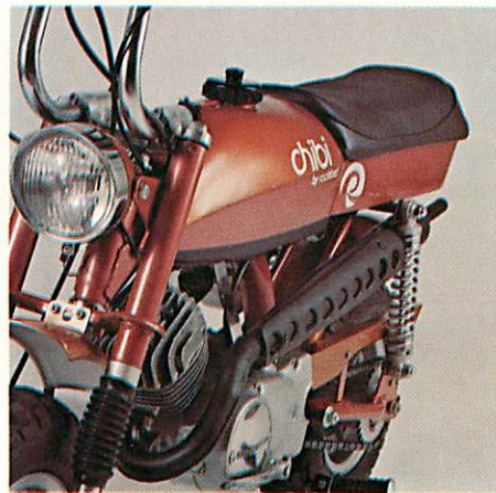
New Chibi styling is highlighted by cleanly flowing tank lines. Saddle base encloses roomy storage compartment.

New lighting system, all new styling, traditional Bridgestone performance — that's CHIBI. Chibi's acceleration and climbing ability have to be experienced to be believed. The 5.8 hp engine and 3-speed transmission can get you places ordinary mini-bikes can't. The folding handlebars and fuel shut-off system make transporting a breeze, too. Test ride a Chibi and get ready to change your mind about what a mini-cycle should be.